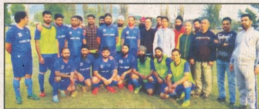
Winners of Football tournament posing along with dignitaries and officials in Baramulla.